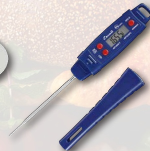
Digital Thermometer, 482°F