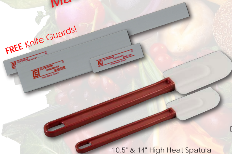
10.5" & 14" High Heat Spatula

Insist on CCI Superior Culinary Master® knives made exclusively in Europe. Enhancing culinary performance for over 50 years!