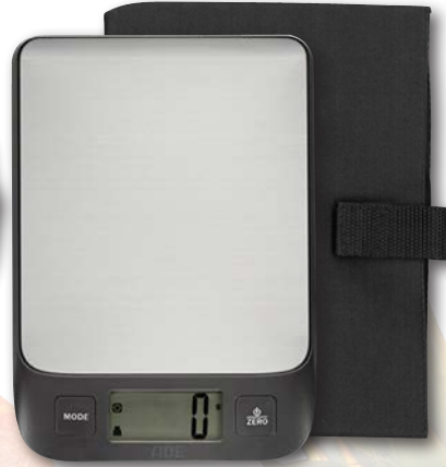
Portion Scale & Pouch