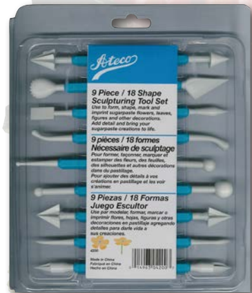
9 Pc. Sculpturing Tool Set