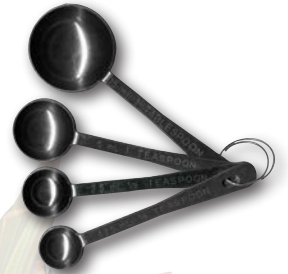
4 Piece Measuring Spoons