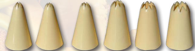
6 Piece Star Piping Tube Set