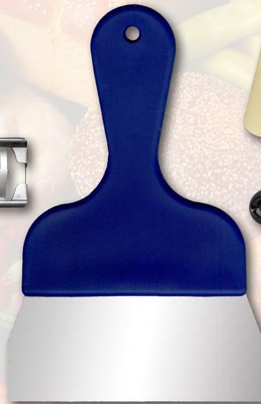
Spatula, Extra Broad