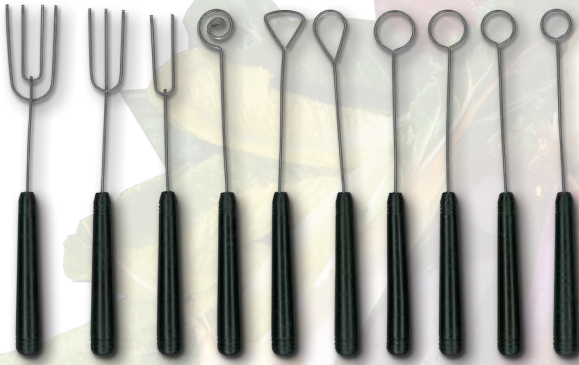
10 Pc. Dipping Tool Set