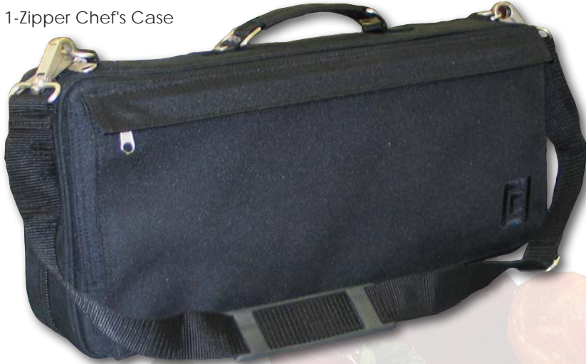
1-Zipper Chef's Case