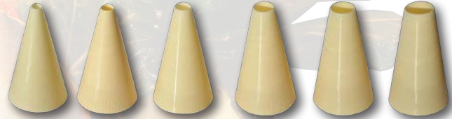
6 Piece Hole Piping Tube Set