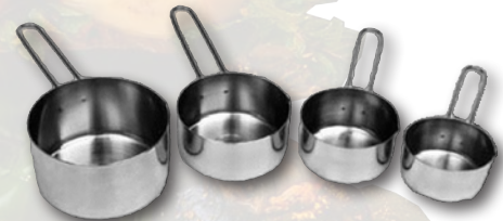
4 Piece Measuring Cup Set